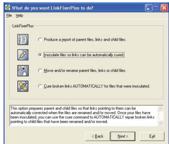
LinkFixerPlus' main functions: Reports, Inoculate, Move/Rename and Cure